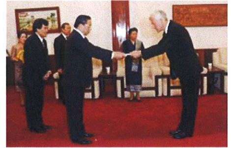
The Netherlands' Ambassador to Laos (right) presents his credentials to President Choummaly Sayasone.