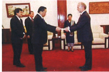
Luxembourg's Ambassador to Laos (right) presents his credentials to President Choummaly Sayasone.